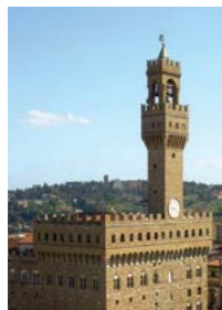
Tower and Battlements

The crenellated wallwalk running along the outside of the oldest part of the building and the elegant tower with its overhang rising to a height of 95 metres served to protect the members of the city government residing here, but they also symbolised these officials' supremacy over the city's aristocracy. The tour allows the visitor to enjoy spectacular views of the city and its surrounding area.