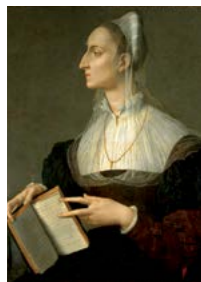
Portrait of Laura Battiferri by Agnolo Bronzino Loeser Bequest