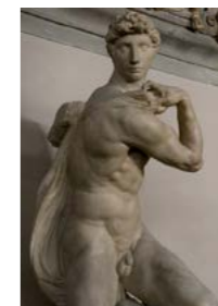
Genius of Victory by Michelangelo Buonarroti Hall of the Five Hundred

The " Salone dei Cinquecento " ( Hall of the Five Hundred ), the most emblematic room in the palace, was originally built in the early 15 th century to house the Maggiore Consiglio , Florence's legislative assembly, after the number of its members increased. Under Cosimo I de' Medici it became one of the most sumptuous of Late Renaissance reception halls and is still the city's primary venue for ceremonial events today. On the same floor, the " Studiolo " of Francesco I was, on the contrary, a miniature wunderkammer open only to the grand duke and his closest guests. On the opposite side of the hall, the Apartments of Leo X are partly out of bounds to the general public because they have housed the offices of the mayor of Florence since 1871.