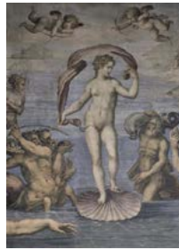
Frescoes by Giorgio Vasari and assistants Room of the Elements

Most of the palace's monumental apartments are to be found on this floor. The Apartments of the Elements are part of a new wing built in the second half of the 16 th century to host the grand duchy's guests and certain government offices. On the opposite side lies the original core of the palace, built in the early 14 th century as the seat of the city government comprising the Priori delle Arti and the Gonfaloniere di Giustizia , whose private apartments and common rooms were situated here. Many of them were later converted into the apartment of Duchess Eleonora of Toledo, the wife of Cosimo I de' Medici.